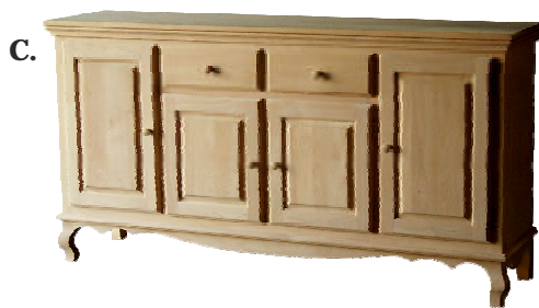
No. 7232-2LD-2-41B BORDEAUX BUFFET

A. Two wood framed French glass G24 doors with antique brass finial overlay hinges. Halogen cabinet lighting system. Three adjustable ¼" glass shelves with polished edges. Beadboard back panel. Wood framed G4 glass side/end panels. Shown optional with antique brass rosette knobs. French arch with hand-carved Flower and Leaf motif 17FT. Bordeaux leg base 41B.