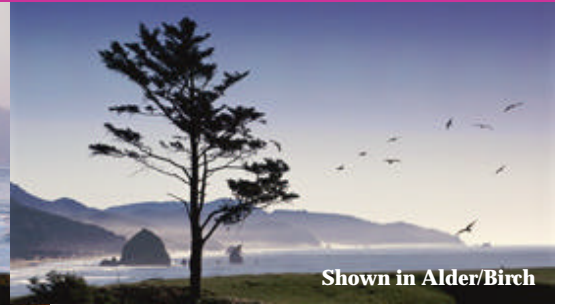
Shown in Alder/Birch