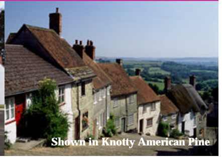
Shown in Knotty American Pine