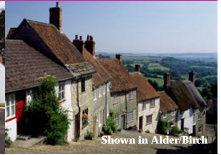
Shown in Alder/Birch