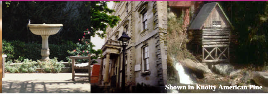
Shown in Knotty American Pine