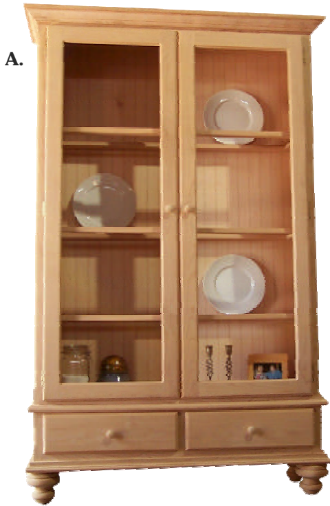
No. E4176CH-G-2H HUNTINGTON CHINA Overall Size 41W x 76H x 19D Case Size 37W x 71H x 17D

A. Two large wood framed glass G1 doors with antique brass finial overlay hinges. Halogen cabinet lighting system. Three adjustable wood framed glass shelves with plate groove and 1/4" inset glass. Beadboard back panel. Flat wood sides. Two linen drawers with smooth running, self-closing European metal roller slides . Solid wood knobs. Crown moulding 7T . Huntington spool feet base moulding 30B .