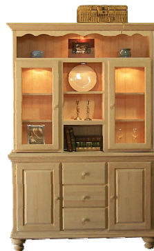
No. 6054-2GO HUNTINGTON HUTCH

Five adjustable wood framed shelves with inset 1/4" glass and plate groove, four compartments, finial overlay hinges, halogen lighting system, beadboard back panel.