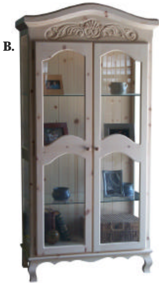
No. F4176GCH-FG-17ST BORDEAUX CURIO CHINA WITH SHELL CARVING

Overall Size 41W x 76H x 19D Case Size 38W x 61H x 17D