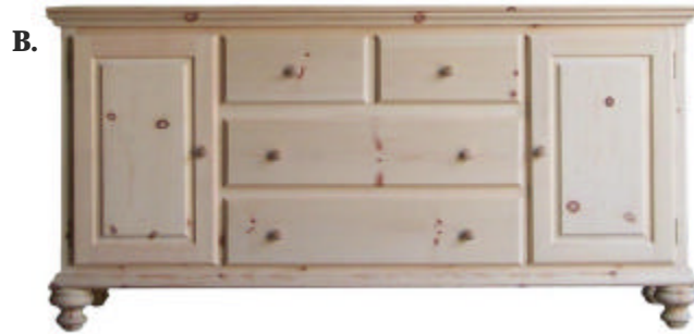
B. No. 7236-2LD-2H-2 HUNTINGTON BUFFET DRESSER Overall Size 72W x 36H x 19D Case Size 70W x 32H x 17D

B. Versatile and roomy, this wide dresser fits nicely in either the dining room or bedroom. There is plenty of cupboard space behind the two raised panel solid wood R1 doors with antique brass finial overlay hinges. Each compartment holds an adjustable wood shelf. Silverware, linens or clothing would fit neatly in the four blind-dovetailed drawers with smooth running, self-closing European metal roller slides . Durable solid wood top. Crown moulding 9T and base 30B . Shown in Knotty American Pine.