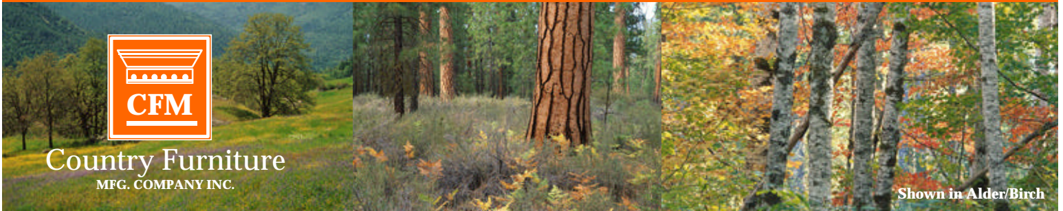
Shown in Alder/Birch