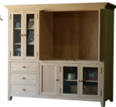
B. Interior View. Stationary shelf above lower doors is 23" h